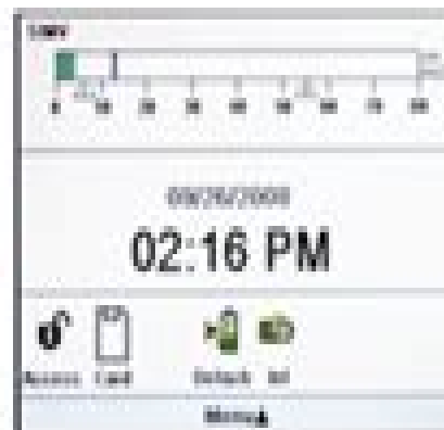
Simple view zoom