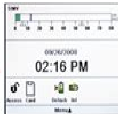
Simple view zoom