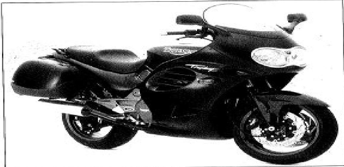
The 1986-on 1200 Trophy

Six months into production, I surveyed a group of 1200 Trophy owners and found the only problem had been rust attacking a