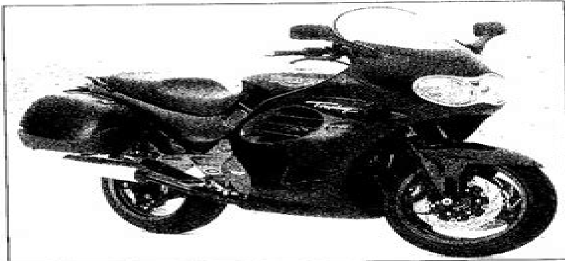
The 1996-on 1200 Trophy

Six months into production, I surveyed a group of 1200 Trophy owners and found the only problem had been rust attacking a