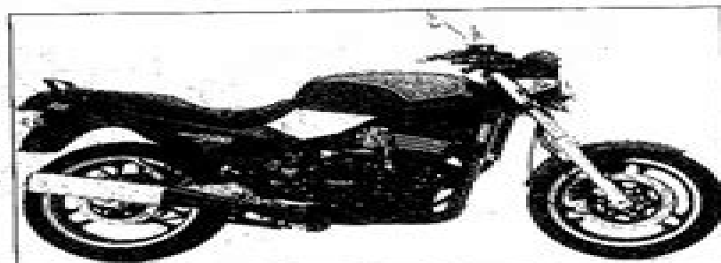
The 900 Trident