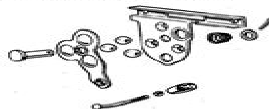
Clutch operating mechanism