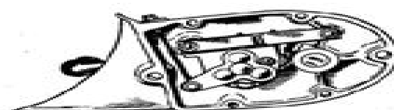
Clutch mechanism installed