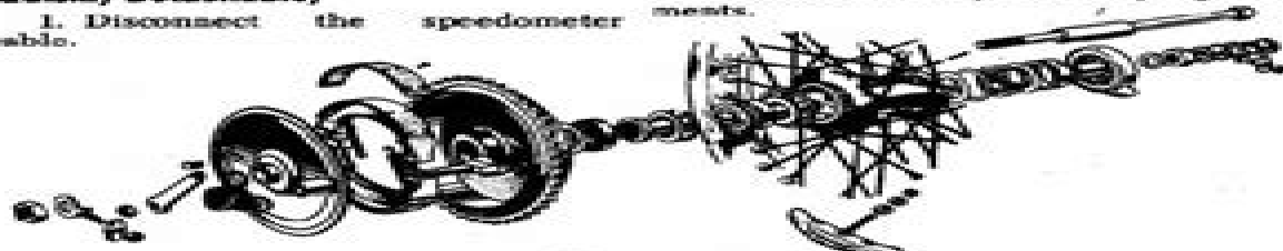
Quickly detachable rear wheel (500 and 650)

Examine all parts as previously described and make any necessary replacements.