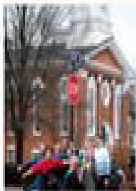
Why You Should Join

So, the trade show season is officially upon us.