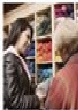
How to Turn Non-