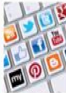
Social Media Not So