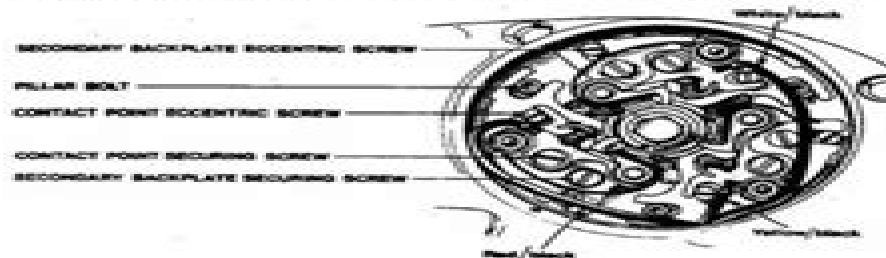
Breaker points (Trident)

6. Carefully remove the cam central bolt and fit an extra washer on the bolt.