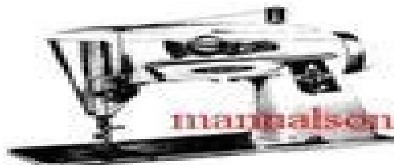
Fig. 1. Machine 500