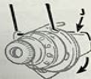
Fig. 9. Threading Tension Discs