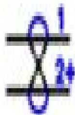
Twisted Pair with Shield