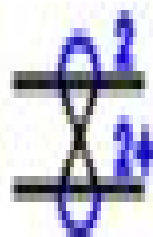
Twisted Pair with Shield (...)