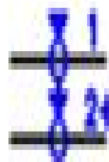
Shield Tied Back