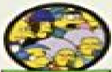
MEET A CAST OF THOUSANDS