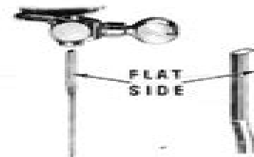
Fig. 1. To Set the Needle