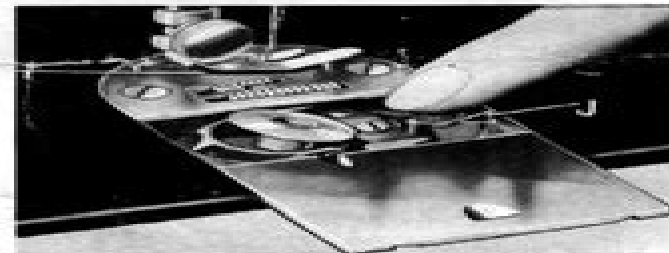
Fig. 3. Removing the Bobbin