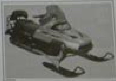
Model - 1000 LT

Weight: 150 lbs (dry) Capacity: 100 lb fuel