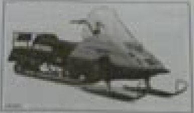
Model - 1000 LT