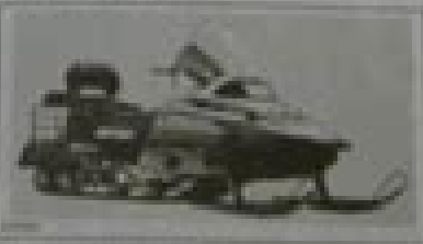
Model - 1000 LT

Weight: 150 lbs (dry) Capacity: 100 lb fuel