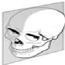
The skull (Sagittal section)

Coloring guide suggestion When coloring, use same color to indicate similar parts