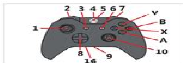
Original Xbox One Wireless Controller