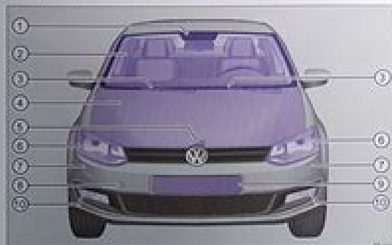
Fig. 2 Overview of the front of the vehicle