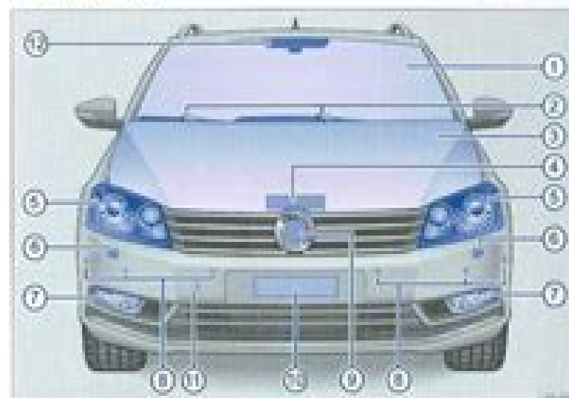
Rys. 2 Widok przodu samochodu