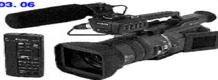
Photo : DSR-PD150