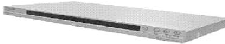
Photo : DVP-NS575P RMT-D165P