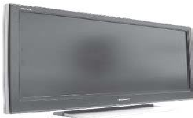
KDL-32S3000 / KDL-40S3000 / KDL-46S3000