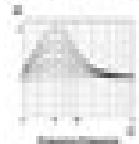
Low level frequency (LFL) Fréquence de réponse (LFL)