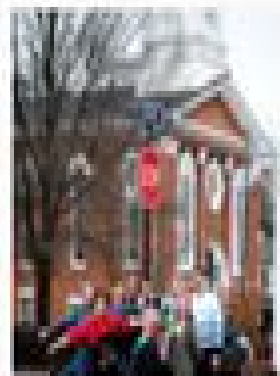
Why You Should Join

So, the trade show season is officially upon us.