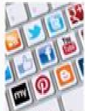
Social Media Not So