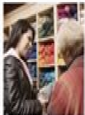
How to Turn Non-