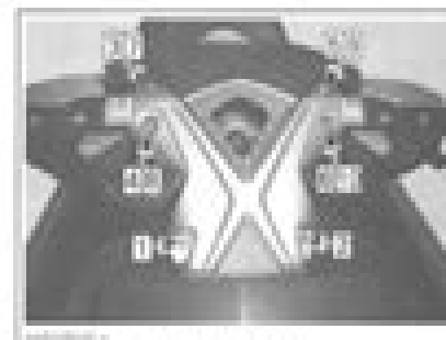
Image 1: Remove the nut securing the engine cut-off switch (O.E.S.S. post) from the rear extension block.

The installation is the reverse of the removal procedure. However, pay attention to the following. Tighten bolts to 25Nm (18.5ft•lb) using the following sequence: