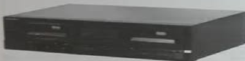
MECHANISM SERIES AR300