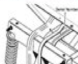
Fig. 2 Serial Number on Front Frame