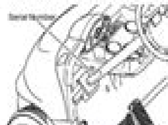
Fig. 1 Serial Number Location on Steering Column

In order to obtain correct components for the vehicle, the manufacture date code, serial number and vehicle model must be provided when ordering service parts.