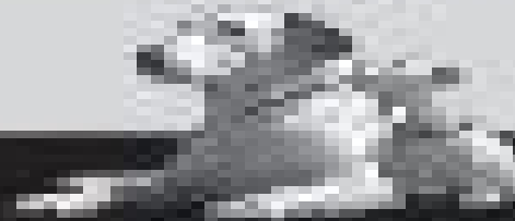
Model RDR4025 (40" diagonal)