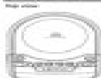
Fig. 2. Top view of the RCA car stereo unit.

3. Do not use the car stereo unit if you are operating a vehicle. Do not use the car stereo unit if you are operating a machine or equipment.