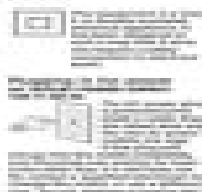
Fig. 3. Rear view of the RCA car stereo unit.

12. Do not use the car stereo unit if you are operating a vehicle. Do not use the car stereo unit if you are operating a machine or equipment.