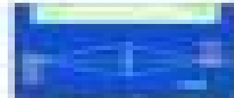
Figure 1: Linear Regression

Linear regression is a statistical method used to model the relationship between a dependent variable and one or more independent variables. It assumes a linear relationship between the variables. The model is estimated using a least squares method, which minimizes the sum of the squared residuals. The resulting model can be used to predict the value of the dependent variable for a given value of the independent variable.