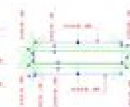
4. Level 2 rectangular opening