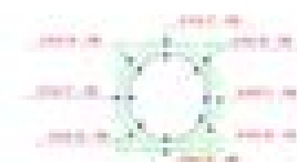
2. Level 2: Circular opening