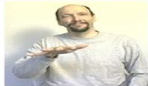
Something is wrong