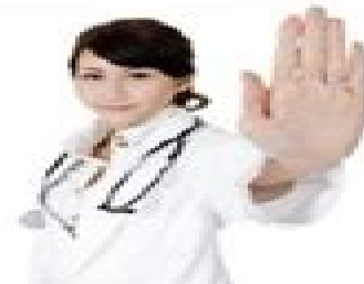
Stop, hold it, stay there