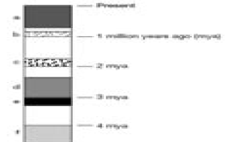
Figure 1 Periods of normal polarity are shown in the same grayscale in the illustration above. Observe that the patterns of polarity in the rock match on either side of the ridge for each ocean basin.

# times reversed polarity has occurred in the last 4million years = _____