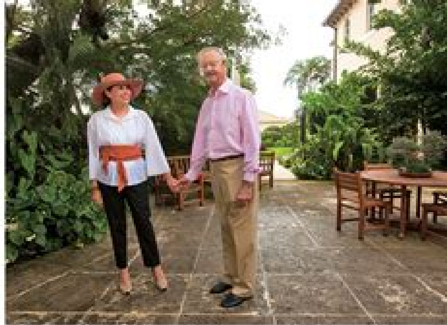
The Duke and Duchess of Marlborough