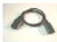
External GPIO Trigger Cable