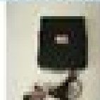
Power Distribution Box