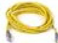
LAN Cable (Crossing type)