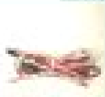
Power Cable for Recorder