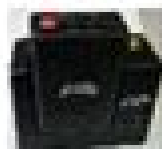
Digital Wireless Mic Receiver & Transmitter