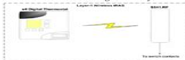
Figure 2 Network Topology