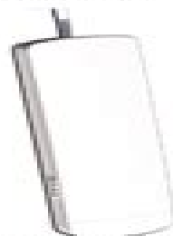
Figure 1 S541.RF/RT3

The RT3 (S541.RFT), a modified S541.RF, comes equipped with a temperature sensor and dispenses with the wiring harness for use as a low-cost remote battery operated temperature measurement device only.