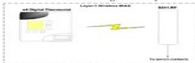
Figure 2 Network Topology