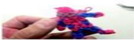
Tie the loops of the gray bands with red bands