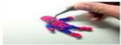
Fine tune the shape of the "eyes" with tweezers.

If the above procedure is too complicated for you, just cut out the eyes from "foamies" and glue them to your project.