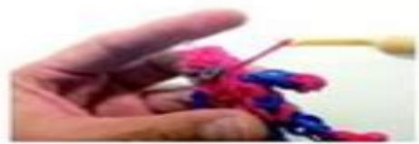
Loop the red bands into the bands on the side of the head