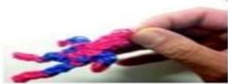
Loop the red bands onto the back of the head and secure with the C-clip (used to secure the end loops)