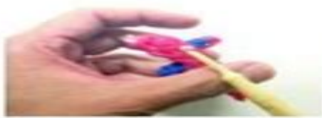
Dig out one of the horizontal bands in the head area.