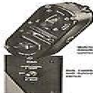
RADIO SECTION RADIO SECTION RADIO SECTION

The radio section is a section of the aircraft which is used to communicate with other aircraft. It is a section of the aircraft which is used to communicate with other aircraft. It is a section of the aircraft which is used to communicate with other aircraft.