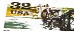
U.S. and Soviet troops met at the Elbe River, April 1945.

The Soviet and U.S. soldiers believed that their encounter would serve as a symbol of peace. Unfortunately, such hopes were soon dashed. After World War II, the United States and the Soviet Union emerged as rival superpowers, each strong enough to greatly influence world events.