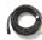
Control Panel Cable