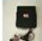
Power Distribution Box