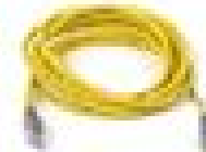
LAN Cable (Crossing type)