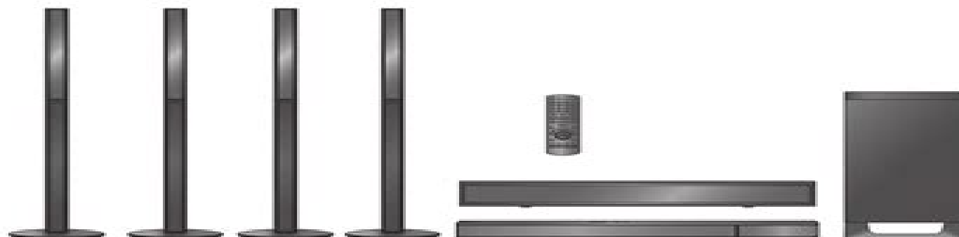
The illustration shows the image of SC-BTT775 for the United Kingdom and Ireland.

Model No. SC-BTT775 SC-BTT770 SC-BTT370 SC-BTT270