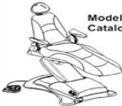
Model: SP30 Catalog: 3303