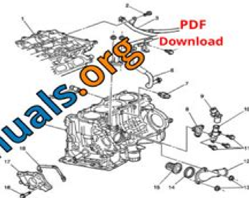
Fig. 5: Oil and Cooling System Components View