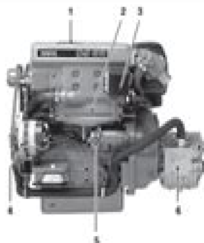
Co-55 A/B with reverse M20L