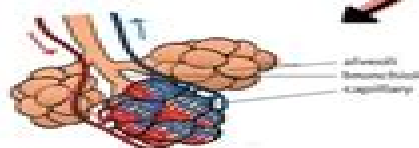
A diagram showing several alveoli and the capillaries supplying them with blood.

The walls of the alveoli separating the air from the blood are very thin allowing gases to diffuse quickly. The blood supply to the alveoli is very good to constantly supply blood with little oxygen and a lot of carbon dioxide keeping a high concentration gradient. The walls of the alveoli are kept moist to allow gases to dissolve into the fluid for gas exchange with the blood.