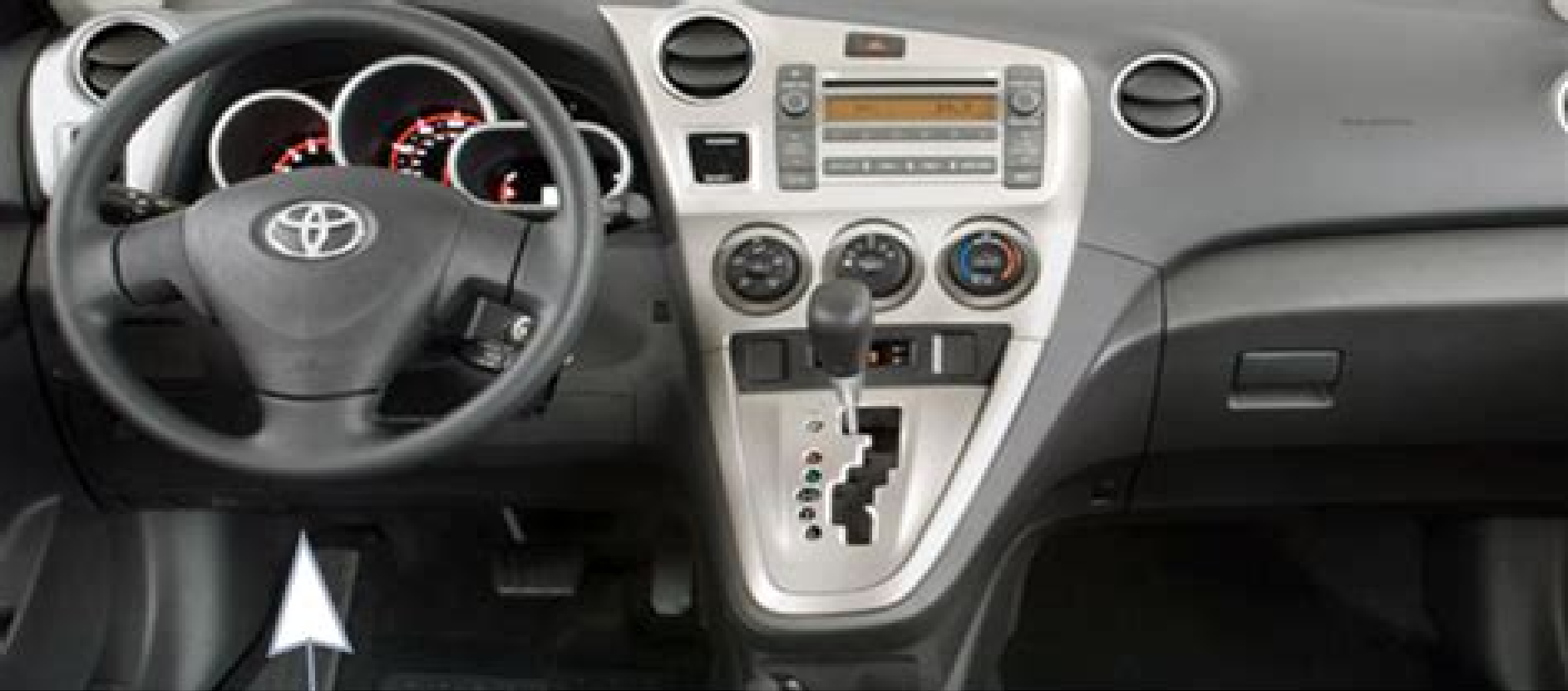
Instrument Panel Fuse Box