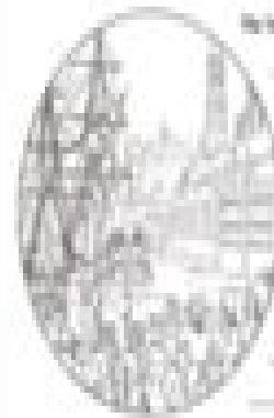
The Battle of the Clouds