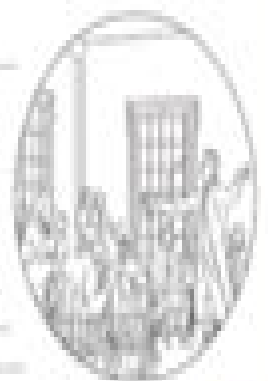
The First Continental Congress