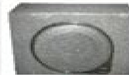
Q-Logic QLT-.6516x box w/ Image Dynamics IDQ-100VC sub