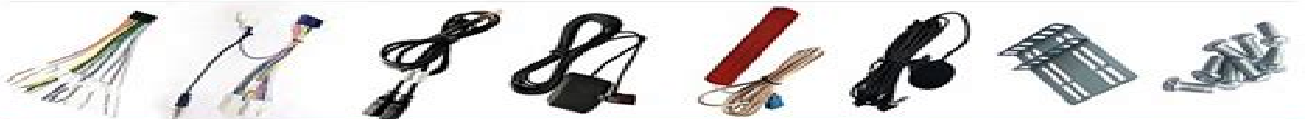
1xPower cable 1xPower cable 1xUSB 1xGPS Antenna 1xWiFi Antenna 1xExternal Microphone 2xInstallation bracket 5xInstallation Screws