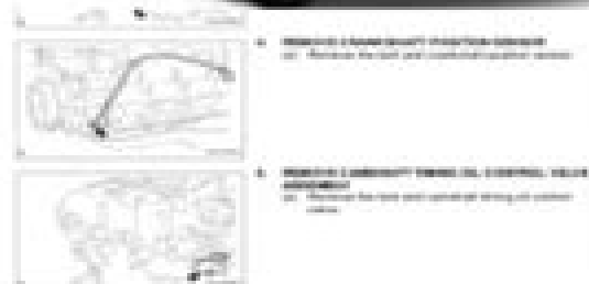
Toyota Tacoma 2004 to 2015