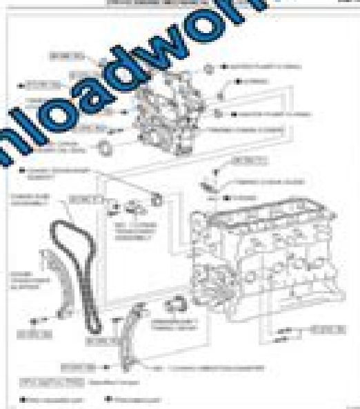
Toyota Tacoma 2004 to 2015 Workshop Service Repair Manual & Wiring Diagrams