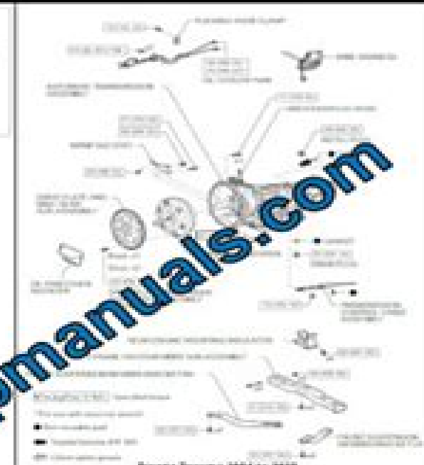
Toyota Tacoma 2004 to 2015